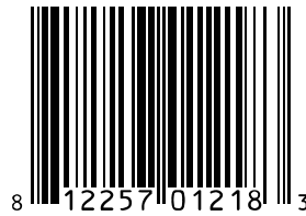
HRS-CRD-01E True View Konig RD Red Dot